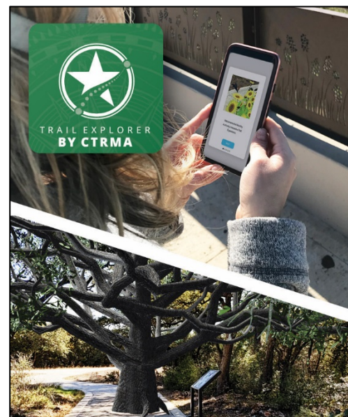
A 45SW Trail user triggers an Augmented Reality animation of a live oak tree growing on the path using the Trail Explorer by CTRMA mobile app.

The Central Texas Regional Mobility Authority (Mobility Authority) is committed to providing Central Texans with innovative multimodal transportation options that offer alternative methods of travel and ease traffic congestion while encouraging healthy and active lifestyles. We design, construct, and implement pedestrian and cyclist friendly facilities like Shared Use Paths, sidewalks and