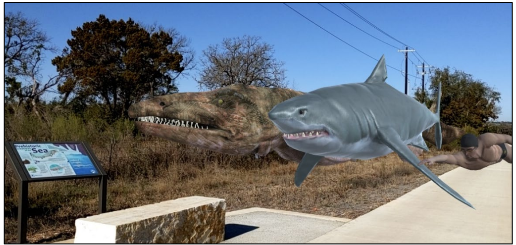
App users can trigger life-size Augmented Reality animations comparing the Mosasaur, a prehistoric sea creature, to a Great White shark and a human swimmer.